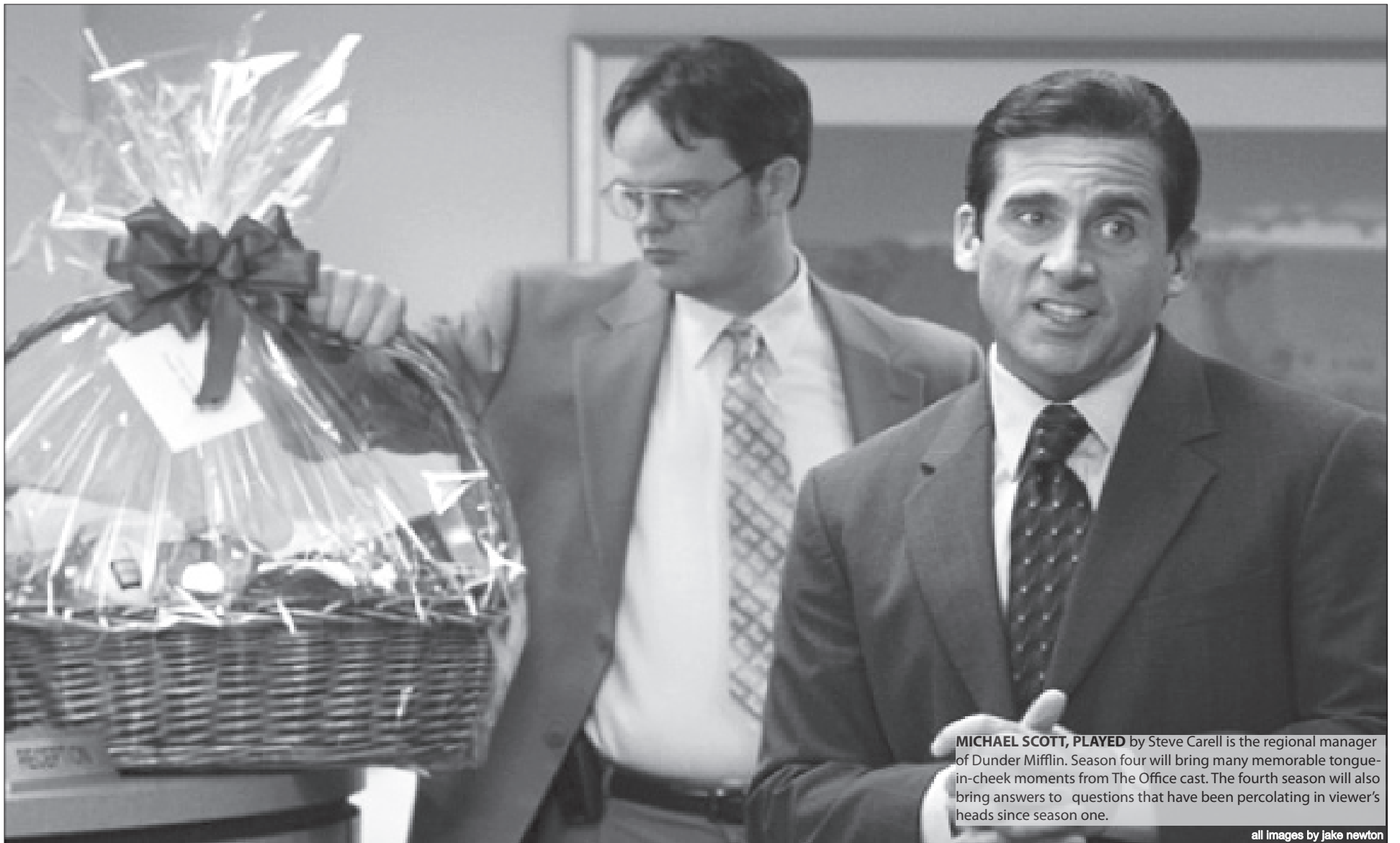
MICHAEL SCOTT, PLAYED by Steve Carell is the regional manager of Dunder Mifflin. Season four will bring many memorable tongue-in-cheek moments from The Office cast. The fourth season will also bring answers to questions that have been percolating in viewer's heads since season one.